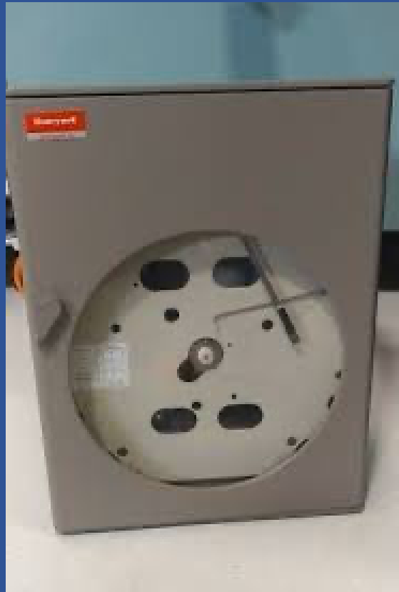
CHART RECORDER CROWN COMPANY 12" 15000 PSI,S/NO:CR10224 P/NO:CRC100 MATARIAL CLASS:STAINLESS STEEL CAST IRON